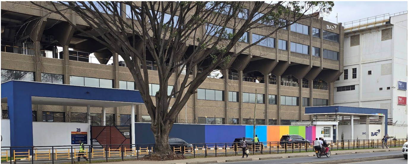
Partial façade of BAT Kenya's factory and office headquarters on Likoni Road in Nairobi's industrial Area

BAT Kenya is part of the BAT Group, a leading multi-category consumer goods business. BAT's purpose is to create A Better Tomorrow™ by building A Smokeless World. BAT has a long history and rich heritage in Kenya, having commenced operations in Kenya in 1907. BAT Kenya was listed on the Nairobi Securities Exchange in 1969 and has approximately 5900 local shareholders. We are a strong, forward-looking company with a proven strategy to deliver sustained value for our stakeholders. Our business contributes to Kenya's socio-economic development in various ways, including supporting the livelihoods of over 80,000 trade and business partners and about 1,800 contracted tobacco farmers.